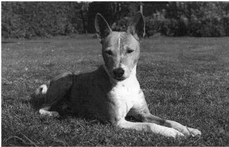
Mbarapi Zande - Deedles at 15 + years old