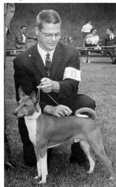
AM CAN CH Feliji Of The Zande