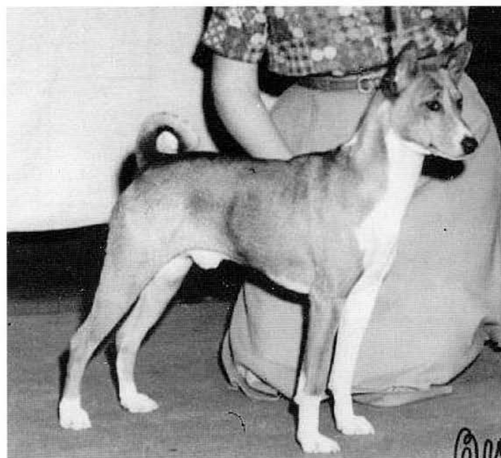
AM CAN CH Chafya Of The Zande