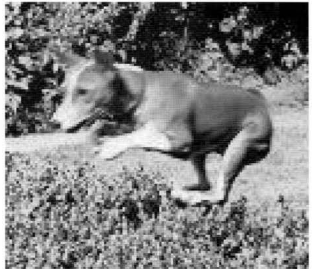
Zande Weledi JW - aka Curly