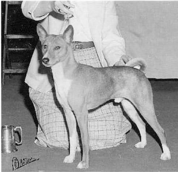
AM CAN CH Fahali Of The Zande