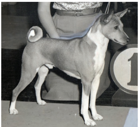
CH Reveille Recruit