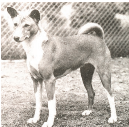
CH Bettina's Bronze Wing