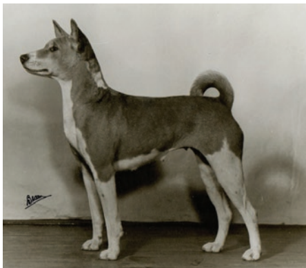
CH Riviana Jollity of the Congo