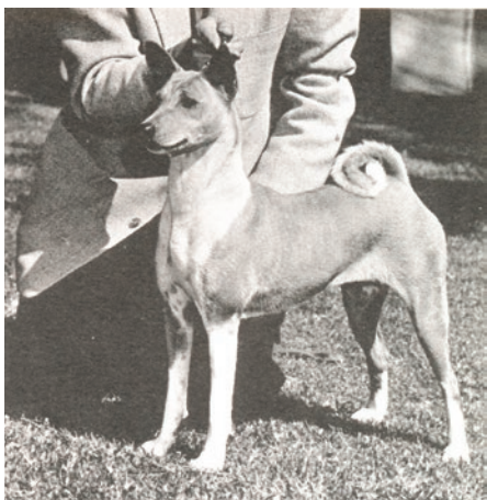
CH My Love of the Congo