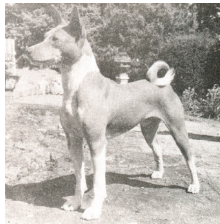
CH Flageolet of the Congo