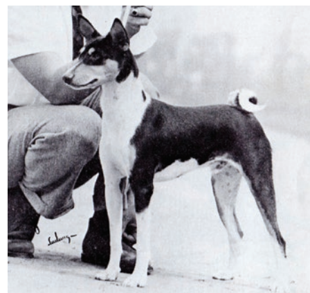
CH Cambria's Ti-Mungai