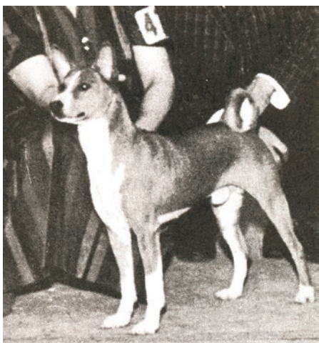
CH Lepper's Mr. Spats