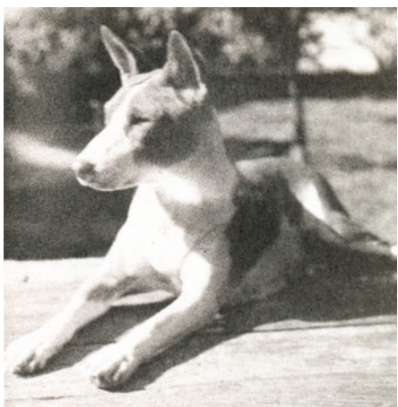
Ka and Ba Meryt-Ra CD